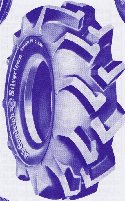
SUPER HI-CLEAT TRACTOR TIRE