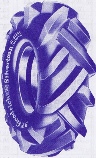
HI-CLEAT TRACTOR TIRE