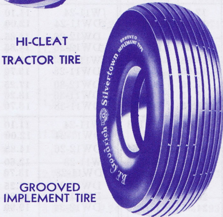
GROOVED IMPLEMENT TIRE