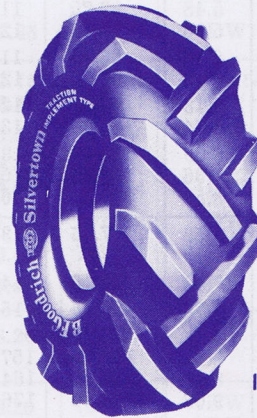
TRACTION IMPLEMENT TIRE (F-2)